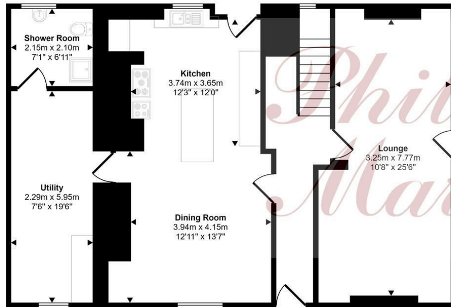
Ground Floor Approx 101 sq m / 1087 sq ft

Approx Gross Internal Area 181 sq m / 1945 sq ft