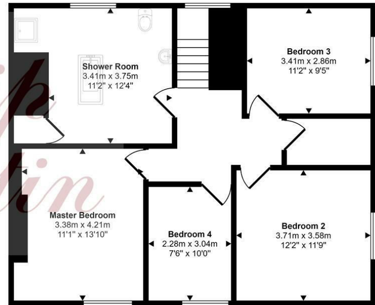
First Floor Approx 80 sq m / 858 sq ft

This floorplan is only for illustrative purposes and is not to scale. Measurements of rooms, doors, windows, and any items are approximate and no responsibility is taken for any error, omission or mis-statement. Icons of items such as bathroom suites are representations only and may not look like the real items. Made with Made Snappy 360.